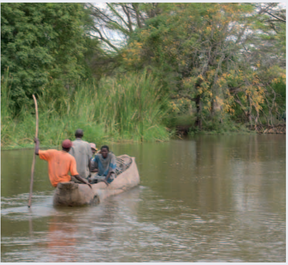
The Pangani river and its associated forest vegetation are crucial to the livelihoods of people living in the area: irrigation, industry, mining, fishing, water for domestic use and for livestock; forests for firewood and charcoal, building poles, furniture.

Msuya's PhD study seeks ways of improving the integration and coordination of the various watershed institutions at different levels. For the management system to truly function, according to Msuya, the diverse institutions