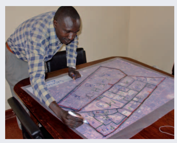
A technician from the Nakuru municipal council preparing information mapped by community representatives for inclusion into a Geographic Information System.

program called NakInfo, and made accessible to the general public on CDs and at an information centre near the town hall in Nakuru.