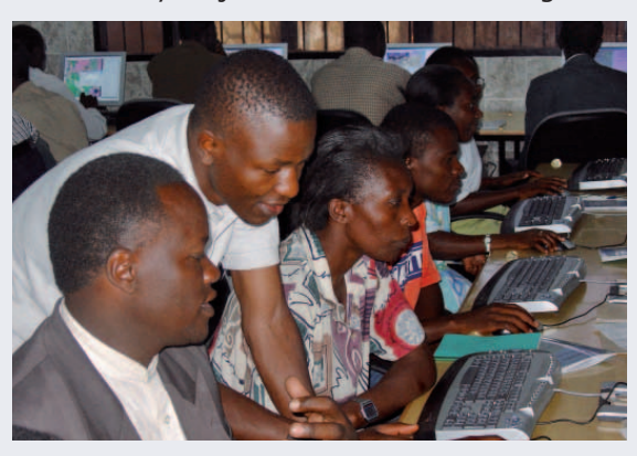
Representatives of Nakuru's local authorities and of the community are trained on the NakInfo software program, which features over 40 layers of spatial data for use in urban development planning and monitoring.

A wide range of people, from community representatives to students, have since made use of NakInfo, either to plan specific projects, such as refuse collection in low-income areas, or to prove the need for development in certain parts of the city: having a map makes it easier to back up claims that a certain area is lacking a school, for example. Making data available in this way can help to increase the participation of people in local communities, and can facilitate dialogue with policymakers, NGOs as well as private investors. The Local Urban Observatory Project received the ACM Eugene