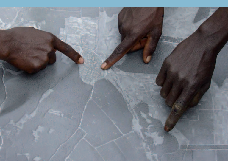
Rapid technical development and increased accessibility of high-precision satellite imagery is gradually promoting the use of spatial data and information in local development initiatives.