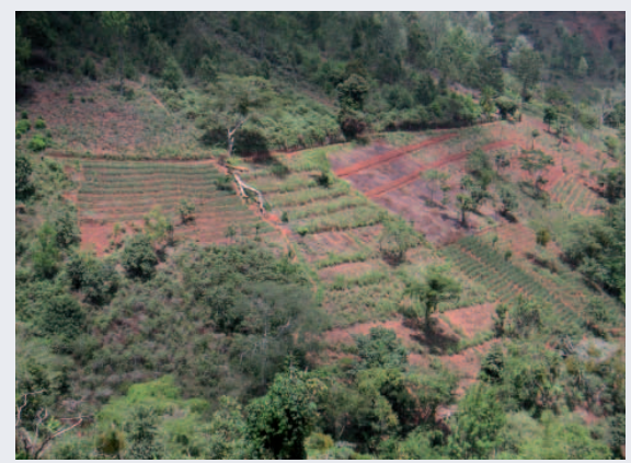
An irrigation furrow in the Usambara Mountains, Tanzania, diverts water from a nearby river to irrigate the fields below it. Lining furrows such as this one would reduce seepage: currently, only 25% of water running through unlined furrows reaches the fields it is meant to irrigate.

Notter defines an "ecosystem service" as the provision of a valued output from the (eco) system, which derives its value according to how well it matches stakeholders' requirements in terms of quantity, quality, location, and timing of availability. Water is a resource; its ability to satisfy these four criteria for a given purpose determines its performance as an ecosystem service. Take drinking water, for example. As an ecosystem resource, it should