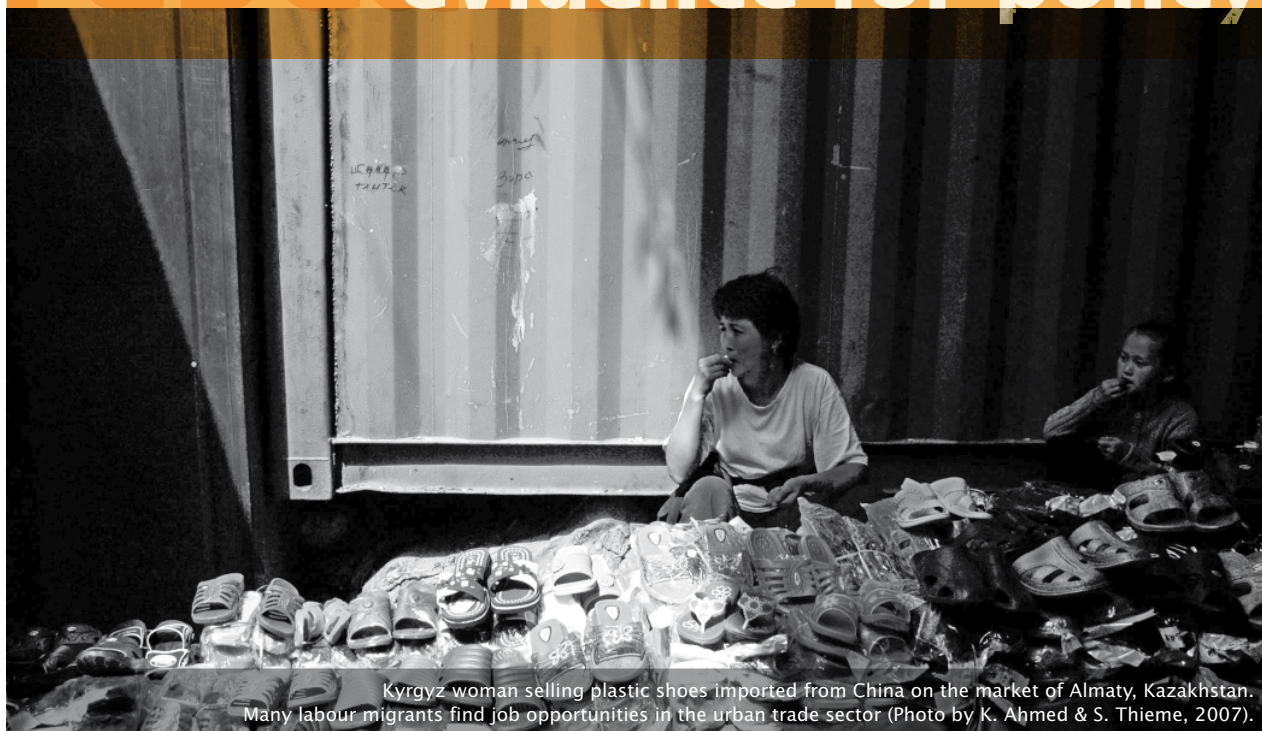
Kyrgyz woman selling plastic shoes imported from China on the market of Almaty, Kazakhstan. Many labour migrants find job opportunities in the urban trade sector.