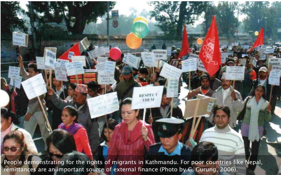
People demonstrating for the rights of migrants in Kathmandu. For poor countries like Nepal, remittances are an important source of external finance (Photo by G. Gurung, 2006).

The World Migration Report 2008 of the International Organization for Migration (IOM) defines circular migration as the fluid movement of people between countries, including temporary or long-term movement, which may be beneficial to all involved if occurring voluntarily and linked to the labour needs of countries of origin and destination. www.iom.int