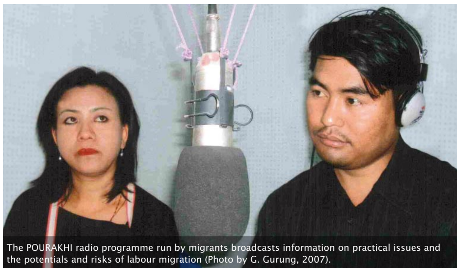
The POURAKHI radio programme run by migrants broadcasts information on practical issues and the potentials and risks of labour migration.